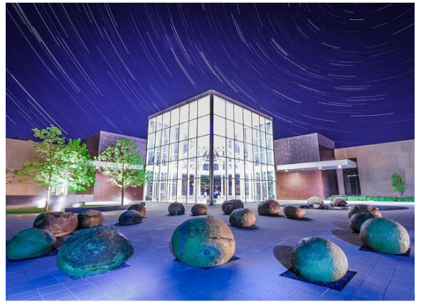
"Heritage under our Stars" photograph by Zachary Hargrove, Bismarck, ND, winner of 2018 ND Governor's Photo Contest